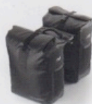
Stromer Antwerp Double Bag 2 x 20 l